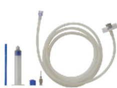
SOI / SOR