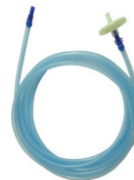
GF / IP